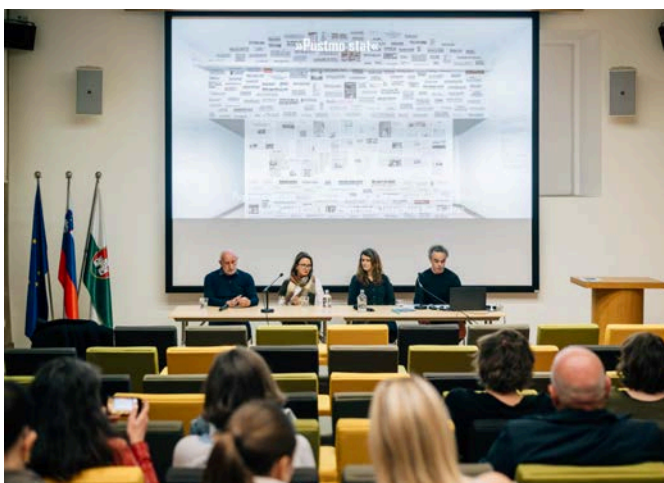
The Valley Exhibition opening and related discussion event at in Ljubljana, 2025, Photo by Blaž Gutman / Arhiv MGML 2025