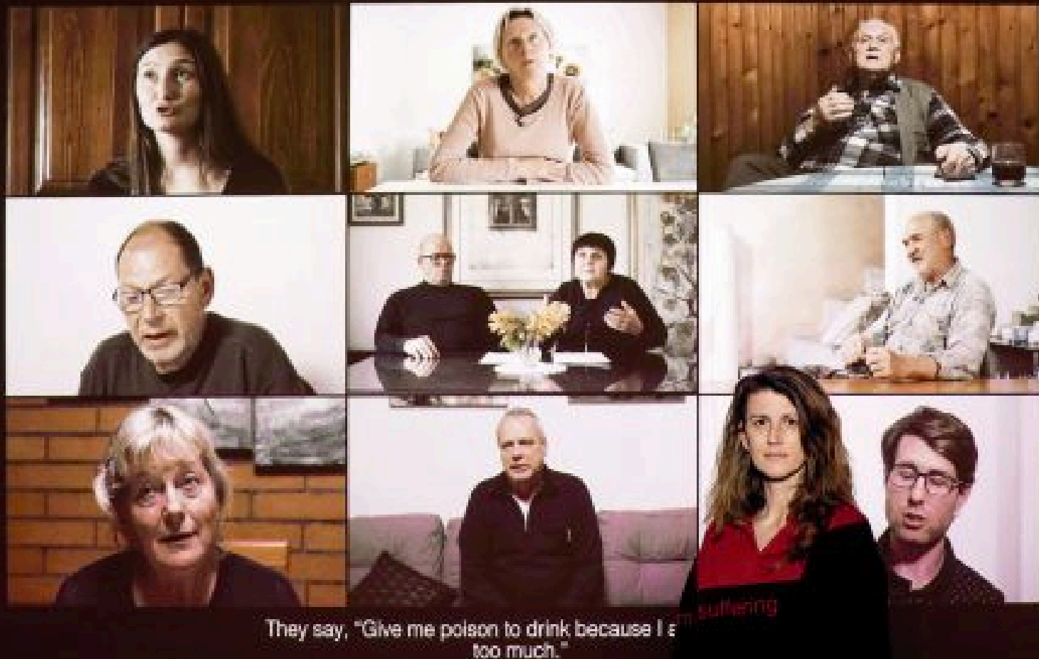
The Valley Exhibition at the Match Gallery in Ljubljana, 2025