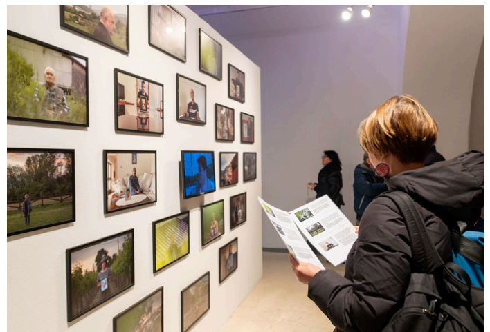
The Valley Exhibition at the Match Gallery in Ljubljana, 2025, Photo by Blaž Gutman / Arhiv MGML 2025

According to the national Clinical Institute of Occupational, Traffic, and Sports Medicine by the end of 2024 at Slovenia level, 3,469 individuals contracted a disease linked to prolonged exposure to asbestos, 90 % of whom were from Anhovo and its surroundings. The installation, based on photographic and video material, powerfully highlights different perspectives of life in the middle Soča Valley, which has been shaped and marked by the coexistence of "the factory" throughout time. From 1921 to the present day, these have included Cementi Isonzo, then in the 1940s Kombinat 15. september Anhovo, later Salanit Anhovo, and today Alpacem Cement